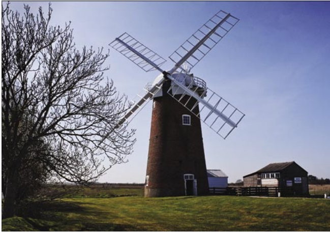
Photographs taken by members on the Newcomers Day out in Norfolk