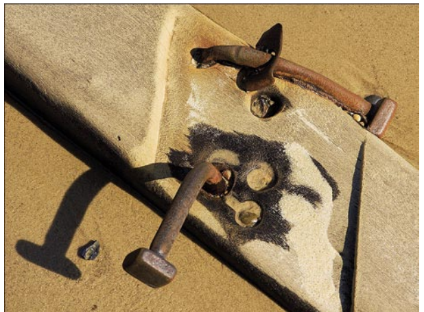
Bottom: Sea Defence Wreckage by Ken Weston